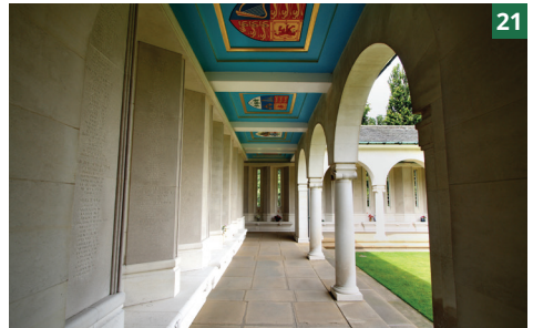
20 PLYMOUTH NAVAL MEMORIAL, DEVON