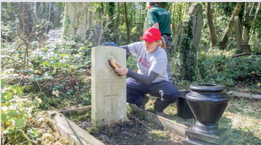
EYES ON HANDS ON VOLUNTEERS CLEANING CWGC HEADSTONES IN ARNOS VALE CEMETERY, BRISTOL