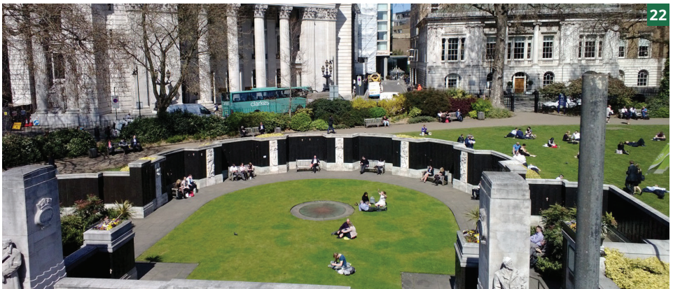
22 TOWER HILL MEMORIAL, LONDON