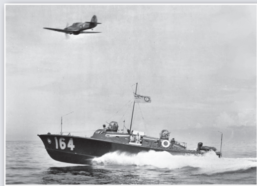
RAF HS Launch