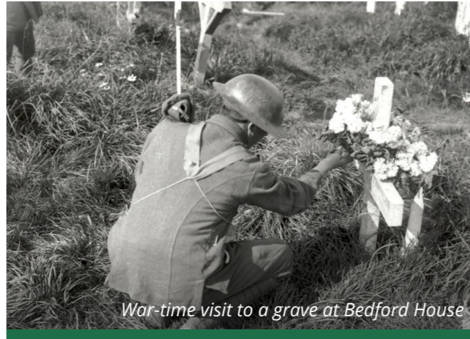
War-time visit to a grave at Bedford House