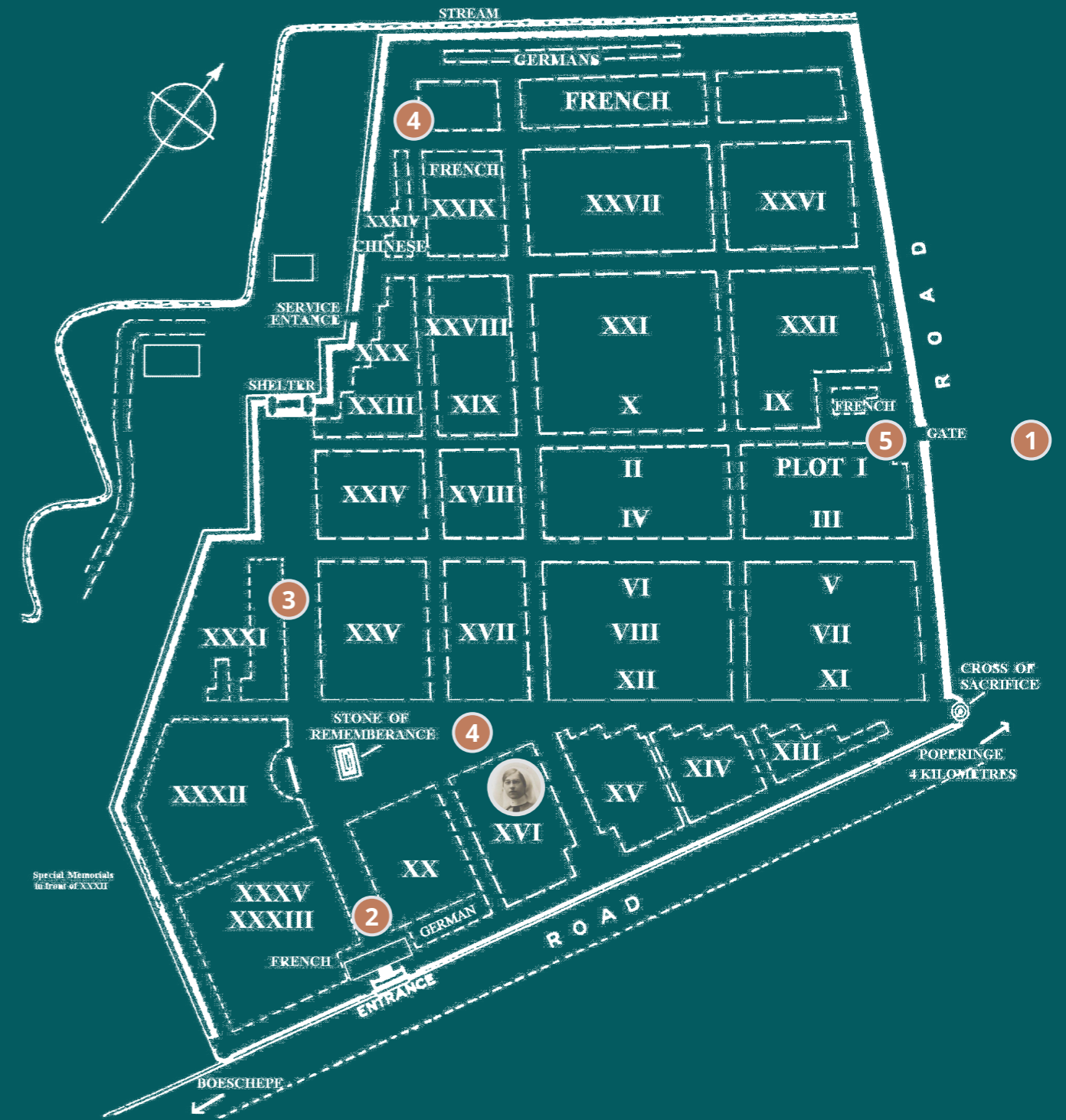
LIJSSENTHOEK MILITARY CEMETERY